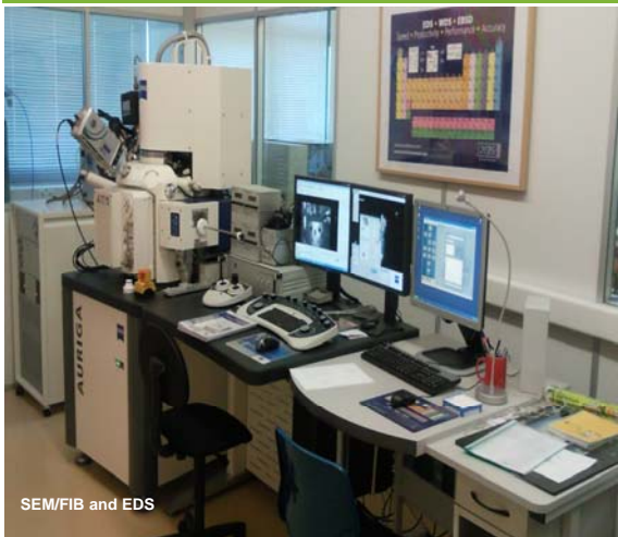
SEM/FIB and EDS

X-Ray Diffraction (temperature, micro diffraction, grazing, texture, stress analysis)