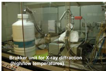
Bruker unit for X-ray diffraction (high/low temperatures)